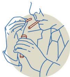
7. SWITCH pencil for cigarette.

The arc doesn't tell our eyes where the hand is going, so we fixate on the hand itself—and fail to notice the other hand reaching into our pocket. "The pickpocket has found a weakness in the way we perceive motion," Macknik says. "Show the eyes an arc and they move differently."