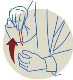
4. SIMULATE pulling out cigarette.