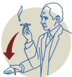
1. PALM lit cigarette.

In their Las Vegas act, Penn narrates each step while Teller demonstrates how something as banal as lighting a cigarette can turn out to be an illusion. What appears to be a cigarette is actually a pencil stub. What the audience thinks is a lighter is really a tiny flashlight. The trick illustrates the seven basic principles of magic: palm, ditch, steal, simulation, load, misdirection, and switch.