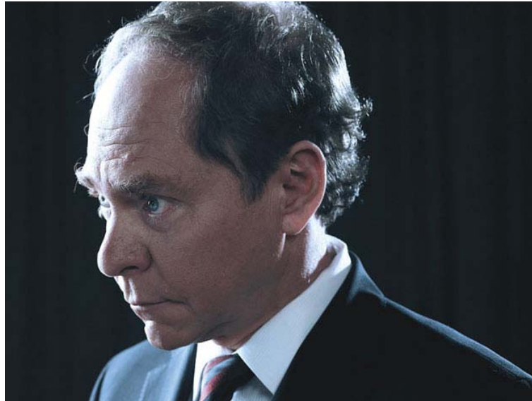
For sleight-of-hand master Teller, magic is a form of experimental psychology.

Penn and Teller are an n of 1 in American culture: avant-garde artists who perform for the Vegas masses, skeptical philosophers who somehow got a cable TV show. For the past 25 years , they've played the same characters onstage. Teller is the silent, impish illusionist—"People are always surprised that I can speak," he says—while Penn is the hyperkinetic impresario, juggling knives, teasing the audience, and swallowing fire. These personae reflect the men's offstage personalities. Penn Jillette is 6'7", with a mane of curly black hair. When he walks, he pounds the floor like a clown in oversize shoes—not surprising, since he graduated from the Ringling Bros. and Barnum & Bailey Clown College. Teller is nearly a foot shorter and dresses in dapper three-piece suits. He has an eerie grace, as if he can move without displacing air.