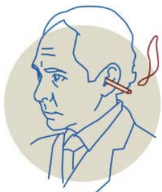
2. DITCH cigarette in ear.

During Penn and Teller's show, the audience laughs at the patsy onstage. But that part of the act is clearly intended as an indictment of human perception. "The irony," Teller says, "is that what we're doing to the volunteer is the same thing we've been doing to the crowd all night."