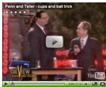
Penn & Teller demonstrate their version of Cups and Balls.

After their first Renaissance gig, where Teller performed in tights and Penn in leather, they were headed back to New Jersey. To kill some time in a diner, Teller was practicing his version of Cups and Balls , a classic sleight-of-hand trick popularized by ancient Roman conjurers. It involves a series of "vanishes" and "transpositions" as the balls appear and disappear underneath the cups. Teller hadn't brought any props, so he used wadded-up napkins and clear water glasses.