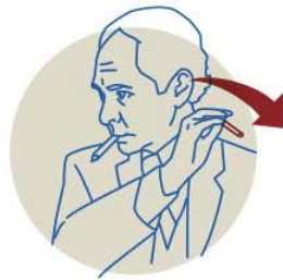
5. LOAD real cigarette.