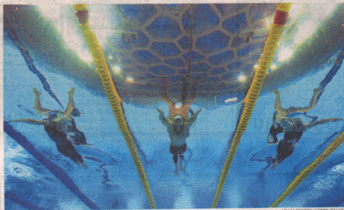
With new suits and a deeper pool, swimmers set as many world records in three days of competition in Beijing as they did in the entire 2004 Olympics. More coverage at nytimes.com/olympics.