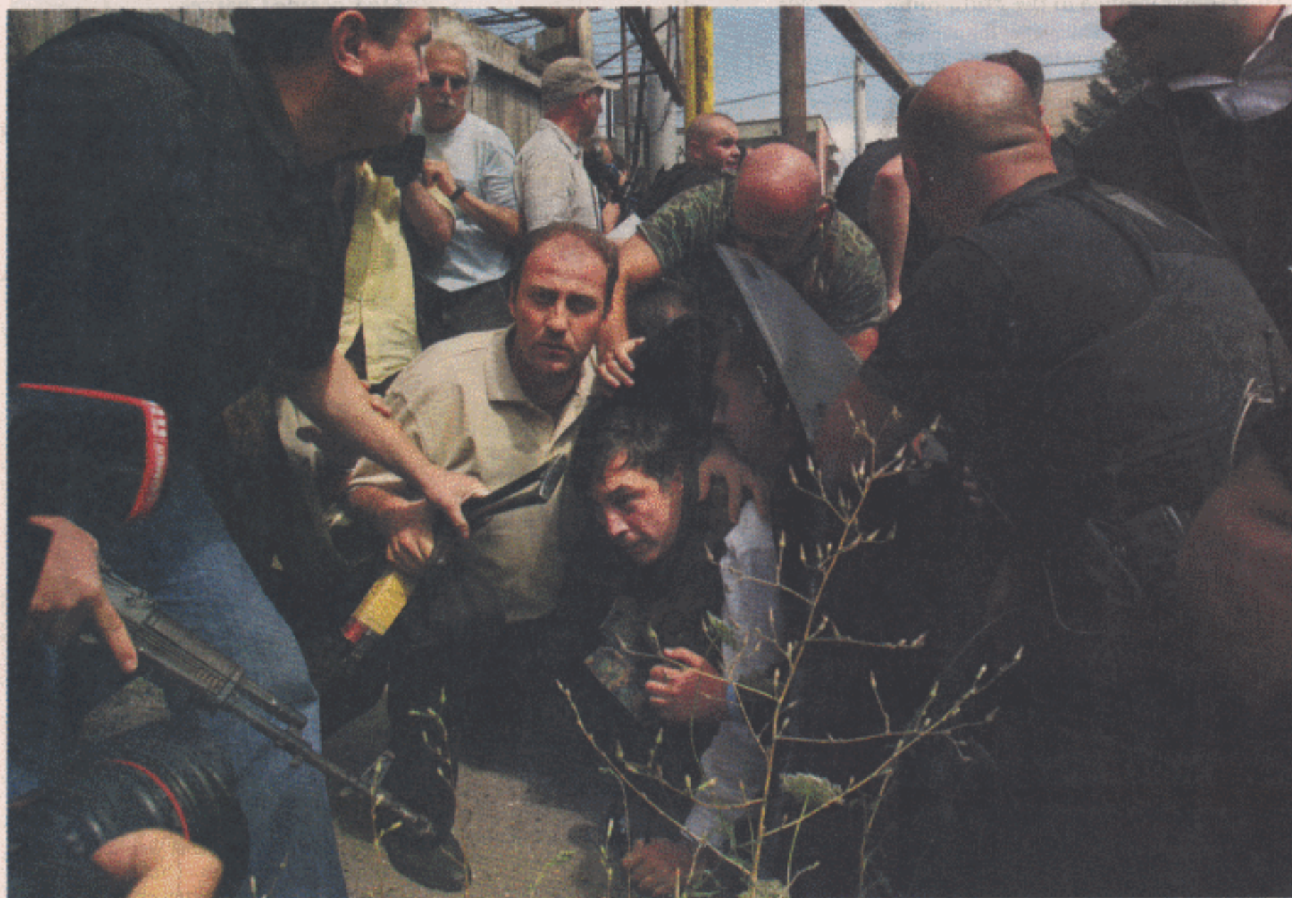
Bodyguards shielded President Mikheil Saakashvili of Georgia on Monday as a Russian jet flew over the city of Gori.