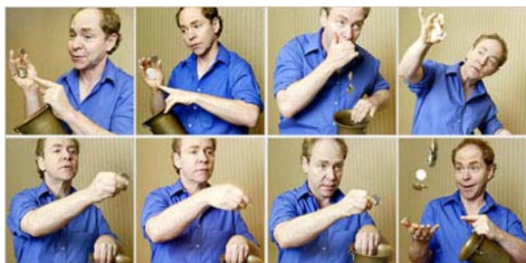
Teller demonstrated Miser's Dream at the Magic of Consciousness symposium in Las Vegas.

Some magicians have intuitively mastered some of the lessons being learned in the laboratory about the limits of cognition and attention.