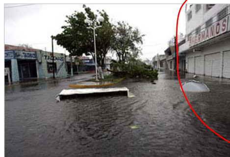
Streets were flooded today in Chetumal, Mexico. Photographs | Video | Times Topics: Hurricanes

The Lede: Hurricanes and History Updates From the National Hurricane Center (noaa.gov)