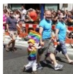
Why gay parents may be better parents