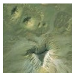
Lost Egyptian pyramids found ... by Google?