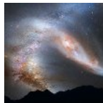
Milky Way, Andromeda galaxies doomed to collide head-on