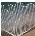
The 10 weirdest animal discoveries of 2012