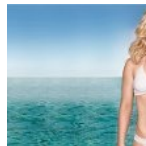
Kelly Osbourne: Diet and exercise really work!