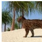
Starvation didn't wipe out saber-tooth cats