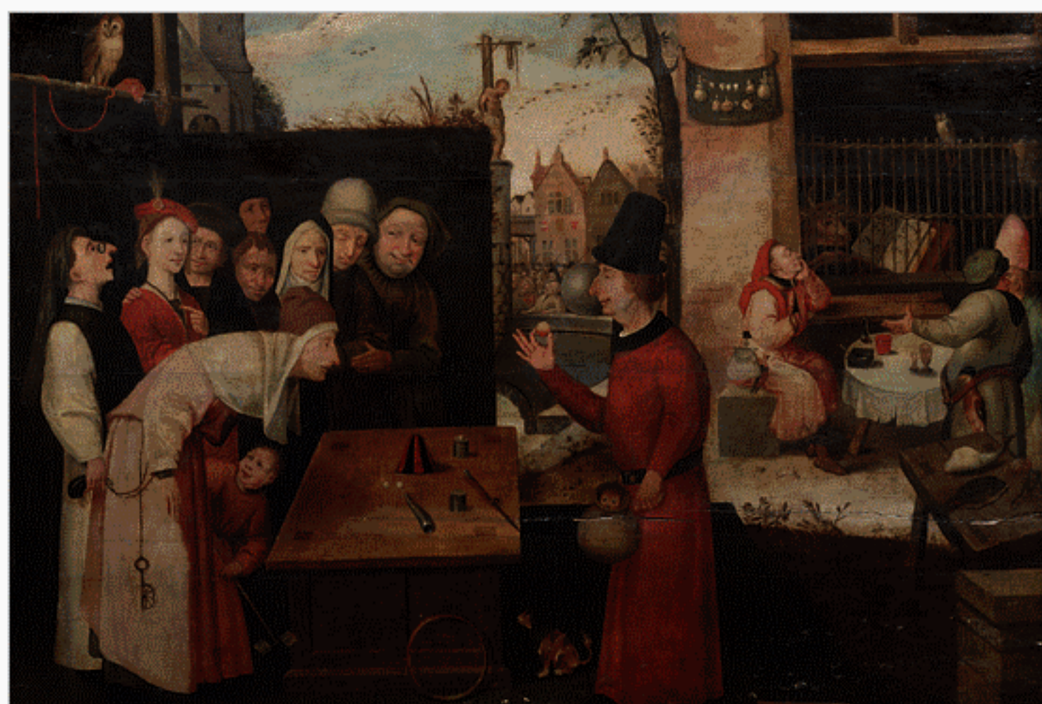
A painting from the 16th century, entitled "The Conjuror."