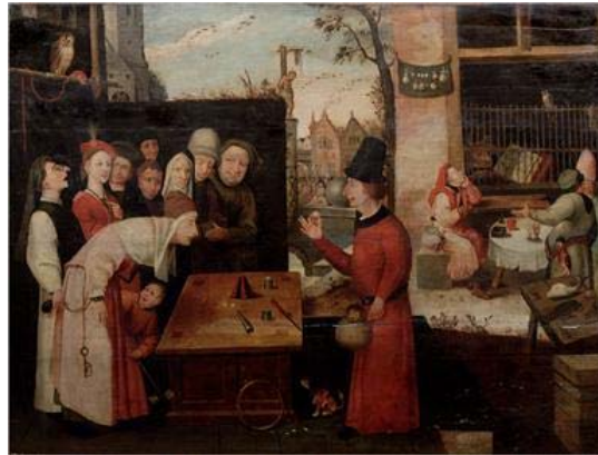
A painting from the 16th century, entitled "The Conjurer."

I often refer to scribing as a magic trick: We watch a human pull images from thin air, grabbing pictures and ideas from the vapor of conversation and giving them physical form.